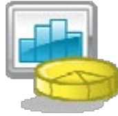
Figure 1. Caption is centered below figure, with one blank line of separation (Georgia 9 pt.)

Figures are referenced in the text (Figure 1).